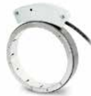
Polymer based polewheel